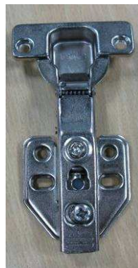
Pic. 2: Front view