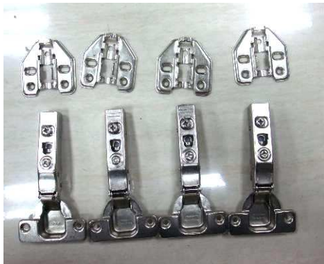
Pic. 1: Hinges view