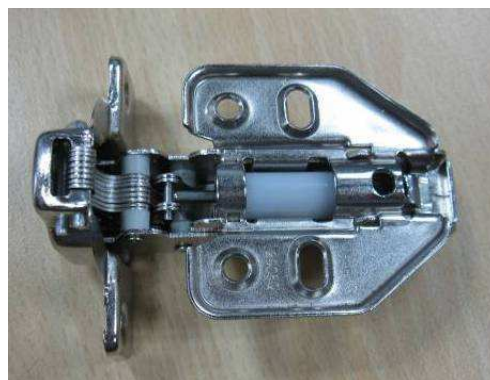
Pic. 5: Fold view