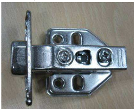
Pic. 4: Fold view